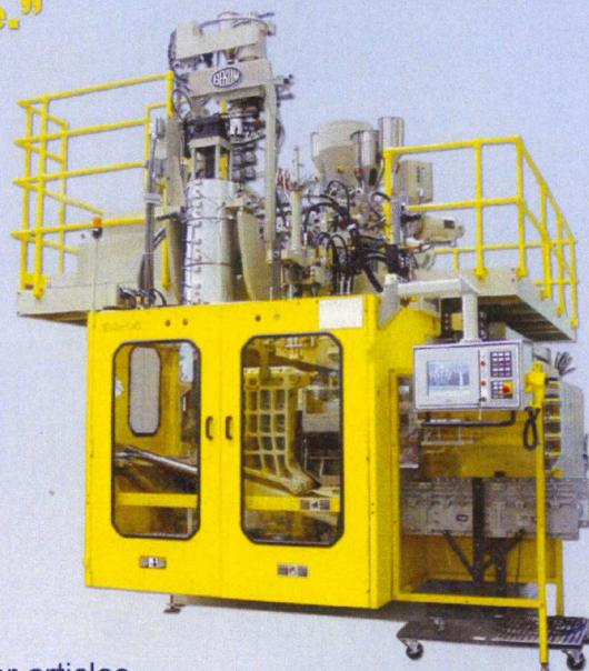
BA-14 CO-EX Bekum America's Development Machine