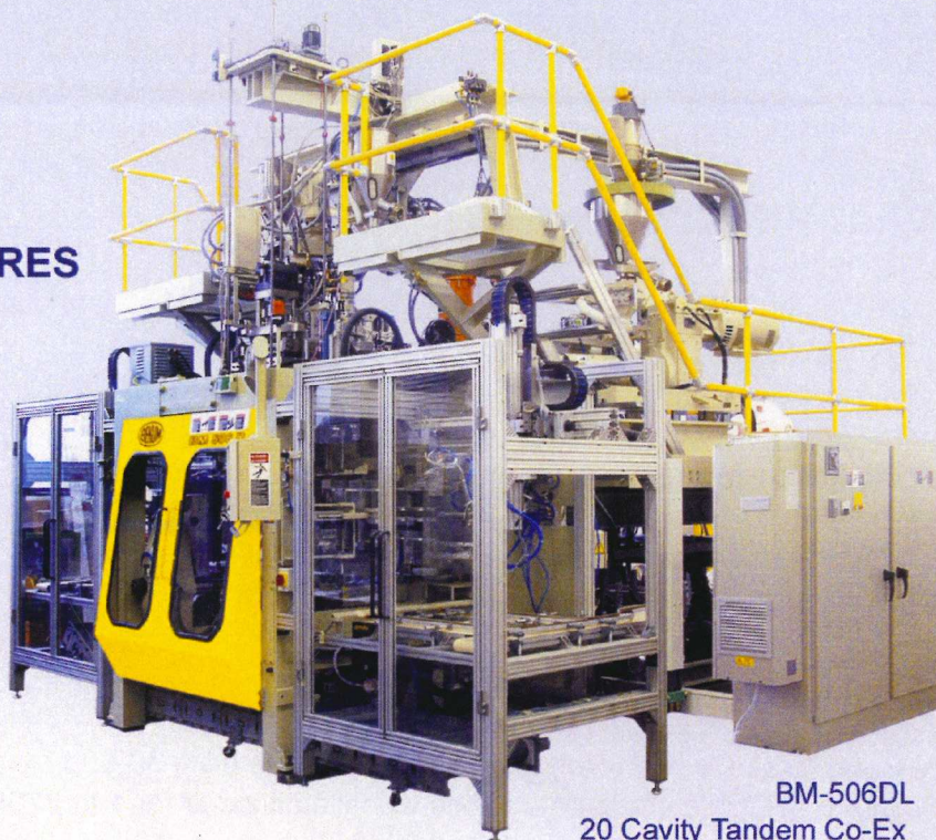
BM-506DL 20 Cavity Tandem Co-Ex